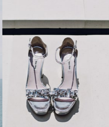
Clockwise from far left: Samujana villas; the bride's "dream" Miu Miu shoes; final prep; fan-style wedding programs; the groomsman in summer suits.