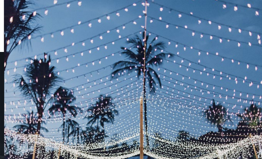
From left: the reception ended with dancing on the beach in Koh Samui; the bride wore a Monique LHuillier dress and Le Louvre veil.