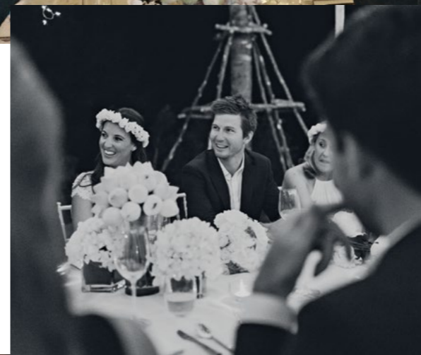
From top: toasts under a canopy of fairy lights; during the speeches; a coconut ice-cream bar in place of a traditional wedding cake.

“The couple made welcome packs for guests, including a map of the island, information on local restaurants, sunscreen and personalised sunglasses.”