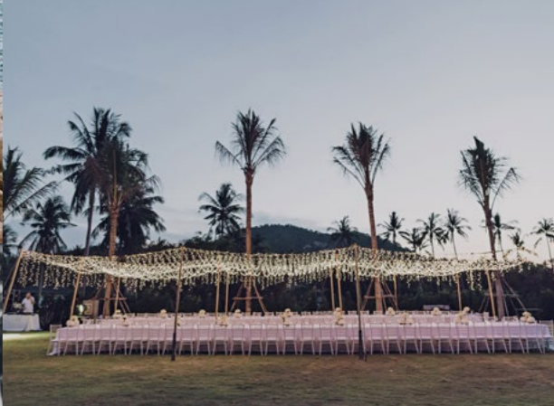
From top: the wedding took place on a grass embankment above the beach to save heels becoming sand-bound; bridesmaids in matching banana print, and all-white for the ceremony.